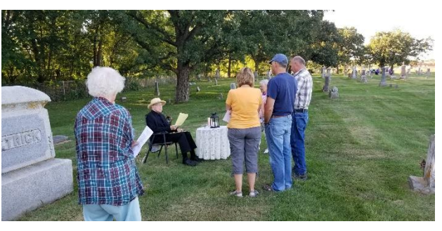
Strolling with the Spirits at Oakdale Cemetery