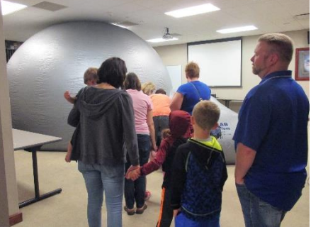
Jen says: The planetarium was a big hit at our house (Along with the virtual reality)!